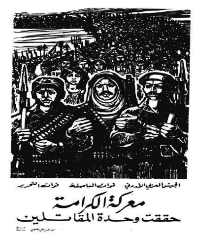
Figure 3. The battle of al Karameh produced/actualized the unity of the fighters (Nabaa, 1971).

Indeed, with al-Fatah's landmark victory at Karameh, which also demonstrated its ability to compel a Jordanian military battalion to join them in the battle against King Hussein's orders, thousands enlisted as new rank-and-file freedom fighters. Al-Fatah came to claim its victory at Karameh as a catalyst for "unifying" the resistance. Take, for example, this 1971 al-Fatah poster (Figure 3) commemorating Karameh: