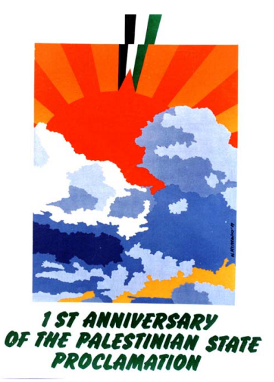
Figure 11. 1st anniversary of the Palestinian state proclamation (Mysyrowicz, 1989).

Following the 1988 Declaration of Palestinian Independence, the dominant current of the PLO began to promote a new national discourse that erased the Fida'i or appropriated it to restore credibility toward the path of negotiations. The image in Figure 11, published by the PLO in 1989, evidences this erasure, but also demonstrates the predicament of the moment: The ambiguity of what was to come next is conveyed in a nebulous arrangement of the sun and clouds that fall beneath a Palestinian flag in the absence of people, land, and symbols of revolution and freedom that had long animated the PLO's poster art in the decades earlier. In the final instance, the proclamation set the foundation in the lead-up to the 1991 Madrid Peace Conference and the signing of the Oslo Accords in 1993 which simultaneously sabotaged the Intifada and erased Fida'i's legacy as a conveyer of Palestinian aspirations.