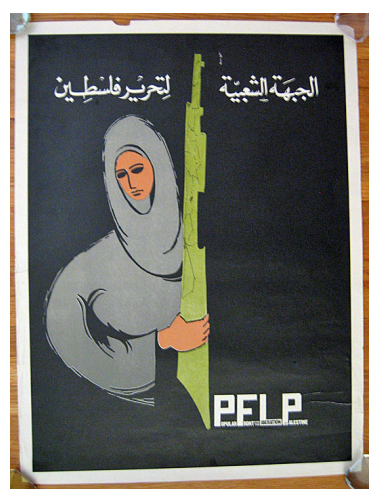
Figure 5. Popular Front for the Liberation of Palestine (Kanafani, 1968).

A 1968 PFLP poster, drawn by the famous Palestinian writer and PFLP spokesperson Ghassan Kanafani, demonstrates the way Fida'i came to embody the importance of social transformations within Palestinian society during this period, particularly the increased normalization of the involvement of women in resistance.