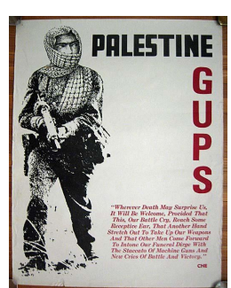
Figure 2. Wherever death may surprise us (General Union of Palestine Students, 1970).

Following the Battle of Karameh, GUPS continued to galvanize popular support and solidarity for Palestine among global revolutionaries by mobilizing the resonant Fida'i icon. Take, for example, this 1970 GUPS poster (Figure 2):