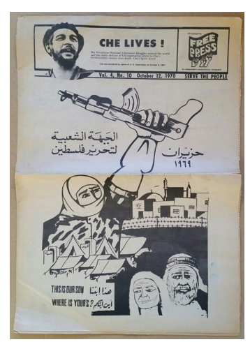
Figure 6. This is our son: Where is yours? (PFLP, 1970).

As illustrated in the PFLP poster in Figure 6, many youths received tremendous support from their parents, who felt pride in and dignity from their children's participation in the Fida'iyyin movement. Ta'amari recalls that the idea for al-Fatah's Cubs and Flowers children's clubs to prioritize education came to him during the events following Karameh, when children were eager to partake and support the struggle (Ta'amari, 2011). Palestinian children of the Fida'i generation were coming of age just as the whole of their society was being remade.