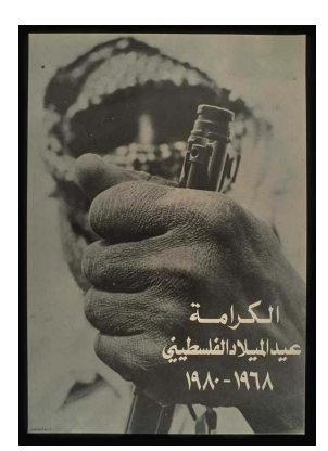
Figure 1. Karameh: The Palestinian birthday (PLO Unified, 1980).

Recounting the gains of this epoch, Palestinian leader Yasser Arafat emphasized this promise: "We did a very important thing. We create[ed] a new people. . . . We were refugees, homeless, we became freedom fighters" (Yaqubi, 2016).<sup>5</sup> An iconic 1980 PLO poster (see Figure 1) affirms such sentiments with the caption, "Karameh: The Palestinian Birthday: 1968–1980."