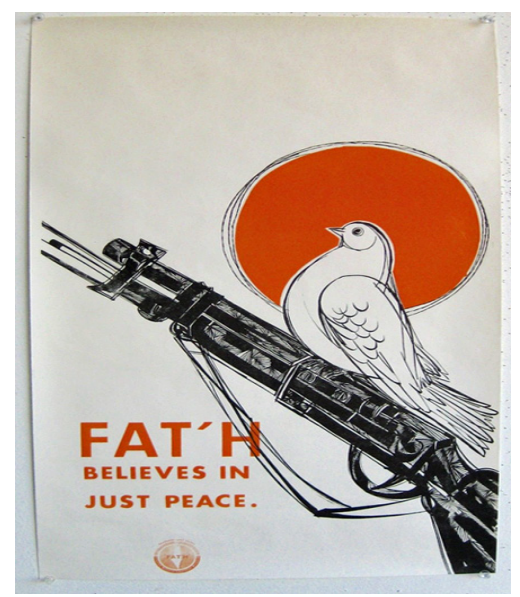
Figure 10. Fat'h believes in just peace (Nabaa, 1986).

parties. Regional and global reconfigurations of power made the PLO more vulnerable, especially after the fall of the Eastern Bloc and the U.S.-launched Gulf War. Without the regional cooperation it relied on as an exilic body, exhaustion, pragmatism, desires for recognition, financial precarity and the economic interests of the Palestinian bourgeoise propelled the leadership to concede on the principles that had anchored the revolution. By the mid-1980s, Arafat had drastically altered the political vocabulary he had used in the two decades prior. The poster shown in Figure 10 encapsulates this new discourse, in which al-Fatah's search for "peace" outweighed its commitment to the people for and from whom the Fida'i was born. This time, the poster made no reference to the people at all. By this period, the Fida'i and many of the principles it had presumably fought for had been all but erased in the dominant political strands of the PLO.