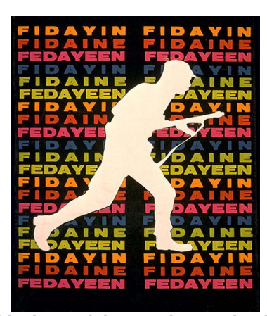
Figure 7. Fidayin—Fedaine—Fedayeen (Padrón, 1968).

Images of the Fida'iyyin circulated in newsletters and pamphlets of anti-imperialist, anti-capitalist, and national liberation movements, student groups, political parties, and unions across the world. Cooperation between global movements and the Palestinian revolution expanded after 1968, both through joint guerilla trainings with Third World insurgents and through the creation of shared educational materials and propaganda (see Figure 7).